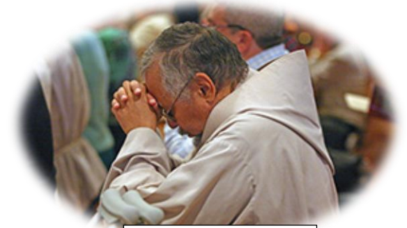
Men of Prayer